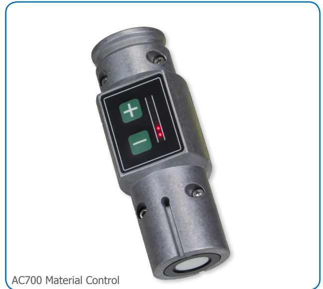
AC700 Material Control

It is operated with push buttons on an integrated keypad with an LED level indicator. The amount of material is easily changed by pushing either + or – on the keypad.