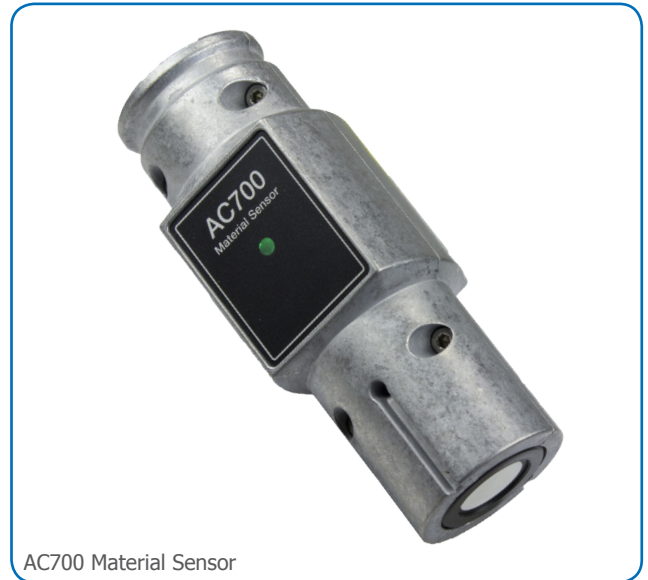
AC700 Material Sensor

It has an LED indicator used for indication of sensor status.