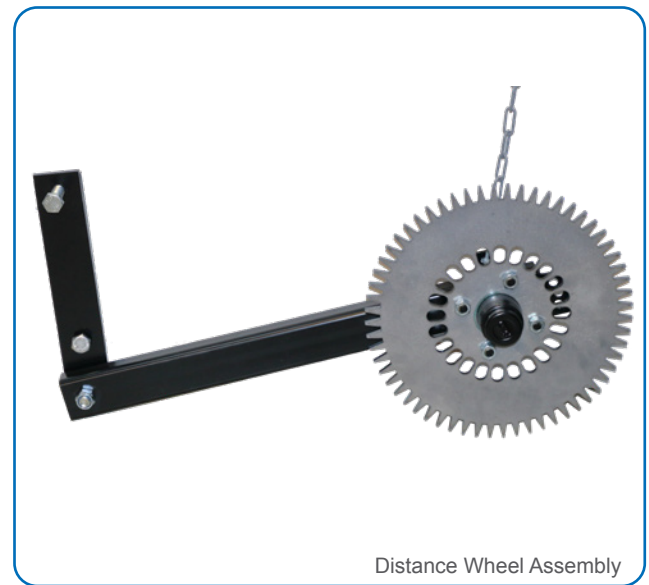
Distance Wheel Assembly

This data can be logged and monitored with the MatManager™ system.