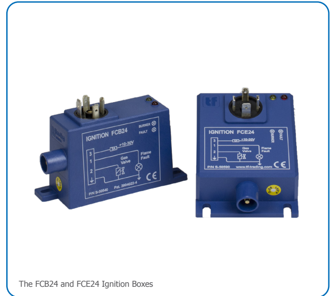
The FCB24 and FCE24 Ignition Boxes

The FCB24 and FCE24 are fully backwards compatible with older model series FCA12V, FCA24V and FCA30V.