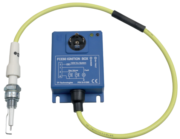
Ignition Box with High Tension Cord, Noise Resistor and Spark Plug