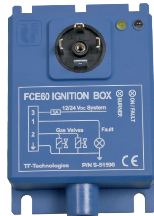
The FCE60 Ignition Box