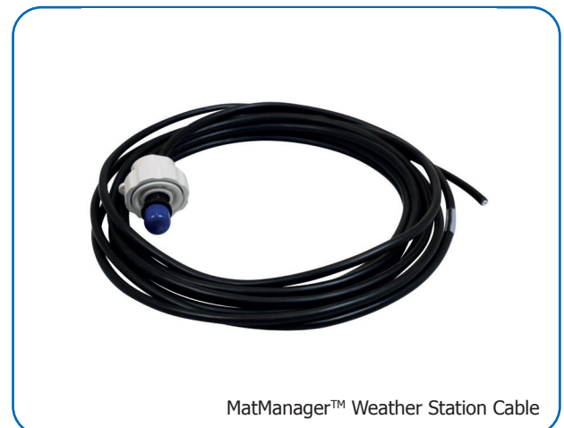
MatManager™ Weather Station Cable