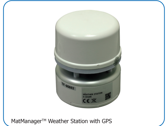
MatManager™ Weather Station with GPS

Weather Station with GPS is included in the Standard MatManager™ System.