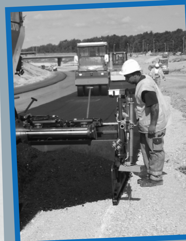
Mini-Line® HS301 Grade Control Kit with G224 on a stringline