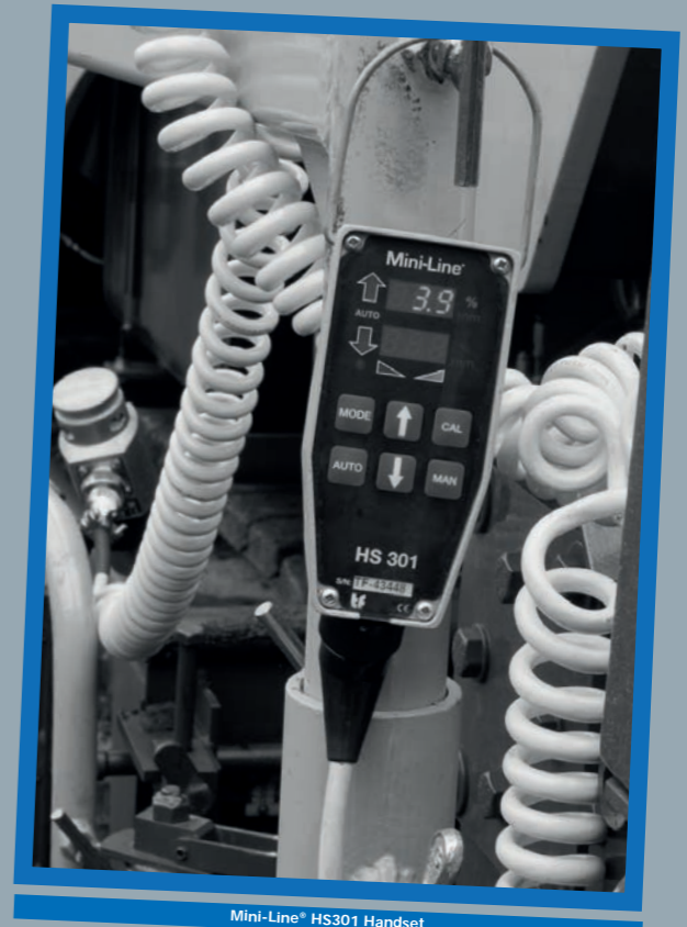
Mini-Line® HS301 Handset