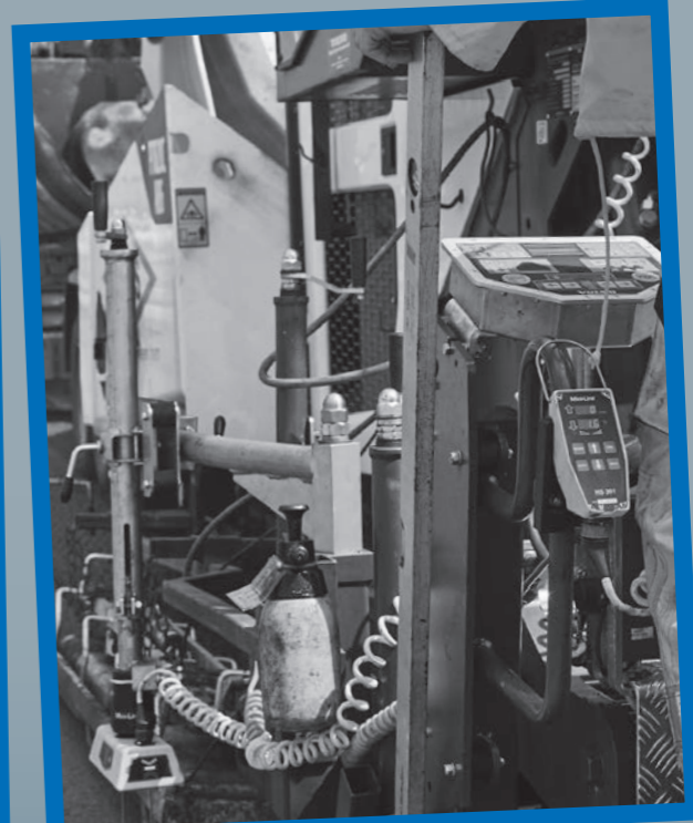
Mini-Line® HS301 Grade Control Kit with G224