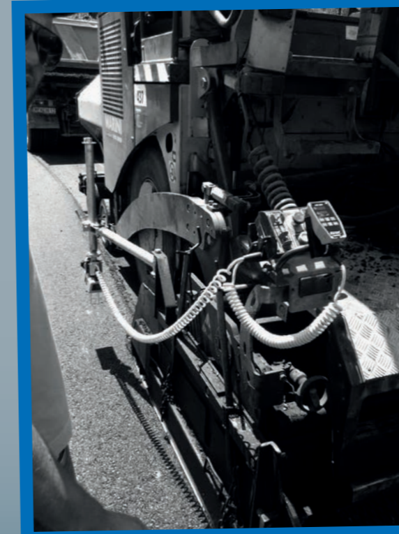
Mini-Line® HS301 Grade Control Kit with G224