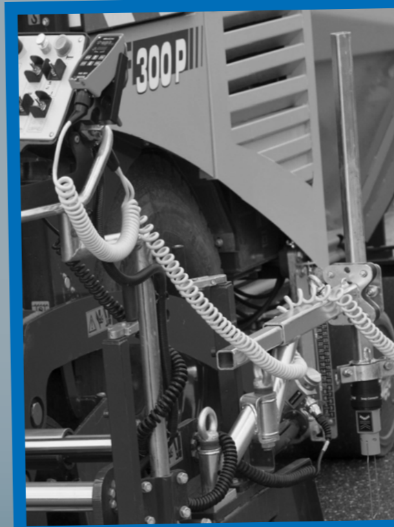
Mini-Line® HS301 Grade Control Kit with G221