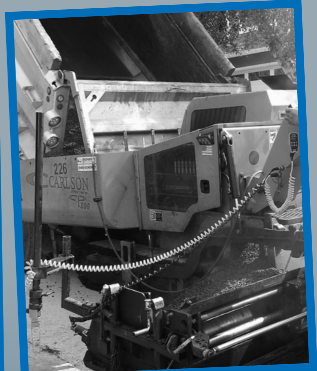
Mini-Line® HS301 Grade Control Kit with G221