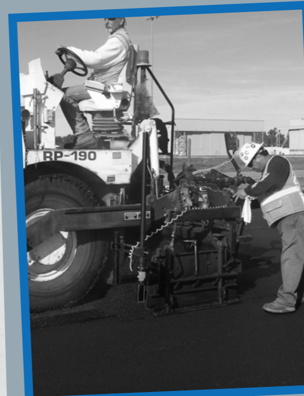
Mini-Line® HS301 Grade Control Kit with G221