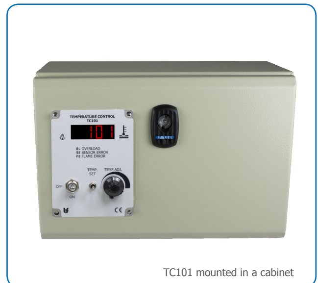
TC101 mounted in a cabinet